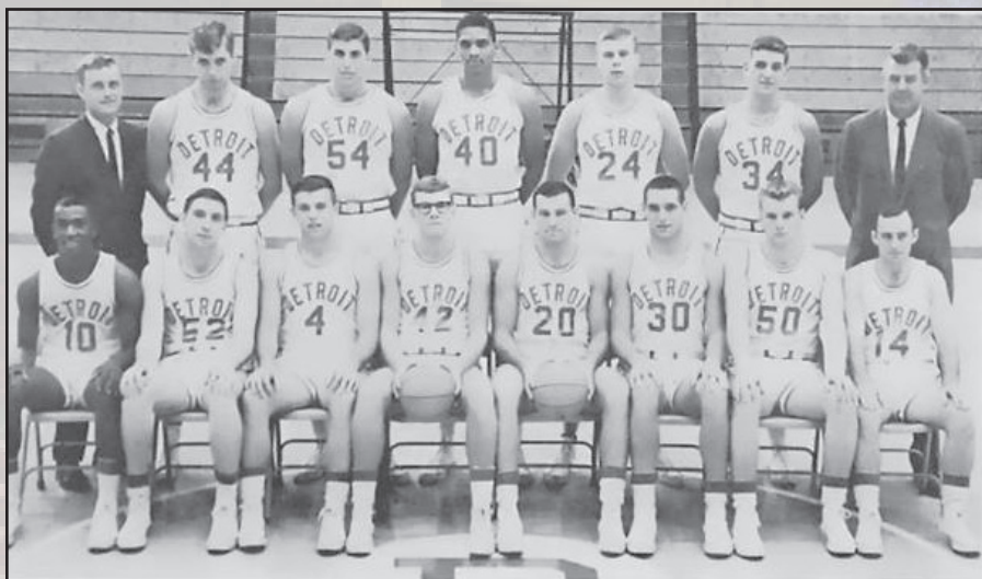
The 1964-65 Titans won the first-ever game in postseason history beating La Salle in the NIT